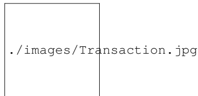
Fig. 4: Transaction states