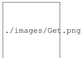
Fig. 1: Get

Figure 1 shows the GET operation with URI restconf/config/M:N where M is the module name, and N is the node name.